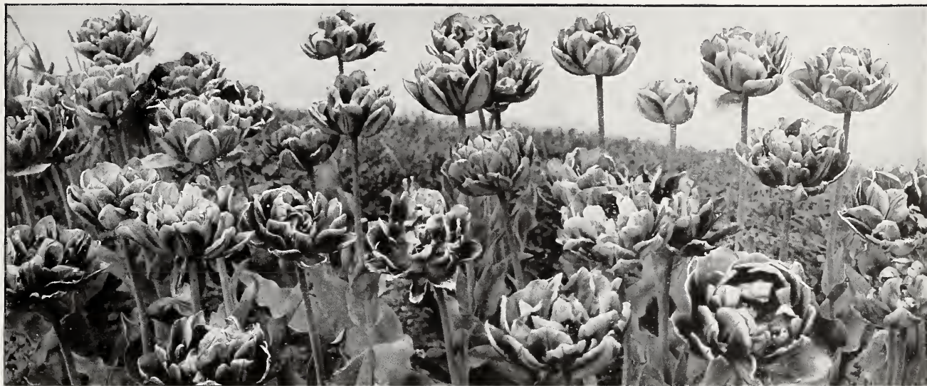
Double Tulips, Couronne d'Or